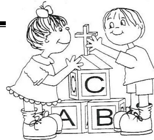
"Learning Through Play"