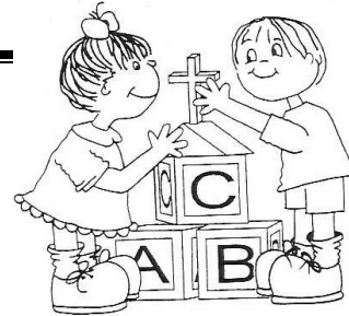
"Learning Through Play"