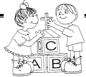
"Learning Through Play"

The Official Newsletter of Providence United Methodist Church Weekday School 2810 Providence Road, Charlotte, NC 28211 Office: 704-714-9373 Fax: 704-365-6800 www.pumcws.org